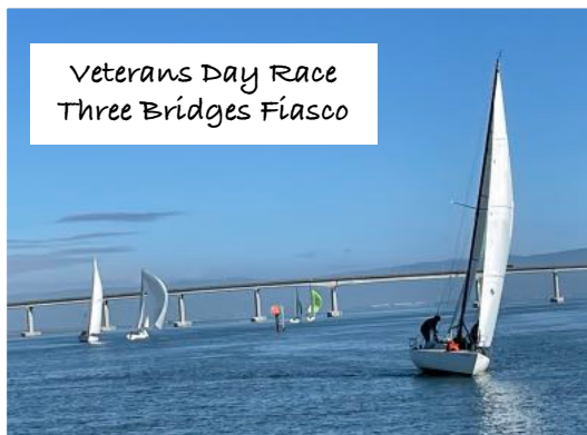
Veterans Day Race Three Bridges Fiasco

Calls to our shore support in Humboldt Bay assured us that the entrance channel conditions were benign and the fog had not reached the harbor. With an incoming tide and a familiarity with the entrance aids to navigation, we made short work of the final leg of our trip, reaching the City Marina at 2200 Saturday night for a forty hour trip and very happy to be home.