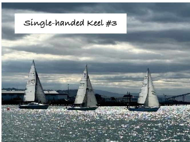
Single-handed Keel #3