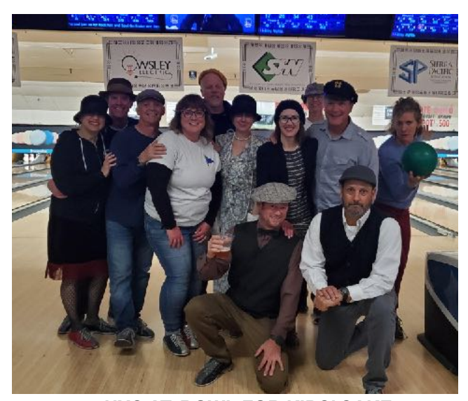
- HYC AT BOWL FOR KIDS' SAKE -

We kicked off March with a successful fundraiser for the Boys and Girls Club at the Harbor Lanes Bowling Alley. We raised almost $3,000 for their cause. Our teams had a fantastic time and we were recognized as a participant in the event.