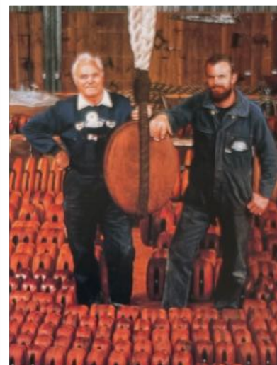
A few of the 700 rigging blocks aboard HMB Endeavour Replica