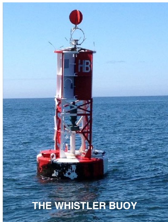
THE WHISTLER BUOY