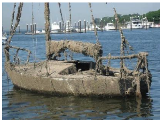
New Product For The Holidays: CHIA BOAT

Nov. 5th - - the general membership will vote on the slate of candidates presented by the Nominating Committee. Nominations of others can be made from the floor before the voting begins. All positions on the Board are up for grabs, so if you are interested in serving next year, let your Co-Commodores know!